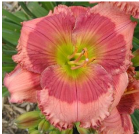
Spoken in Parables