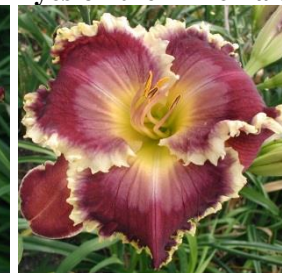
Gnashing of Teeth