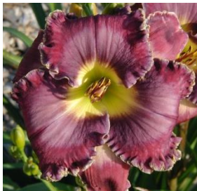
Desire of Nations