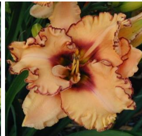
Woman at the Well