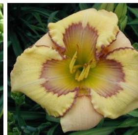
Cast Your Net