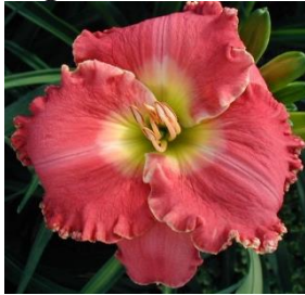
No More Tears