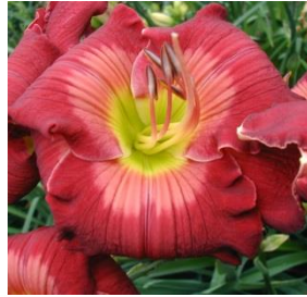
Man of Sorrows