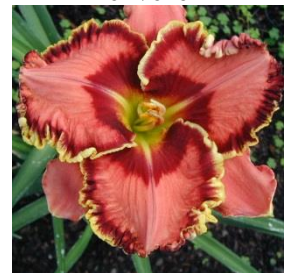
Fearfully and Wonderfully Made