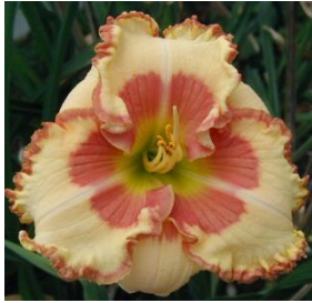
Light of the World