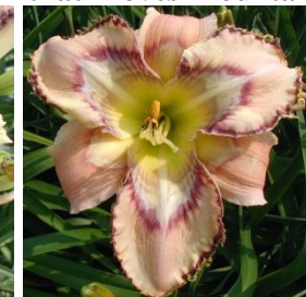
Handwriting on the Wall