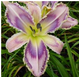
Entwined in the Vine