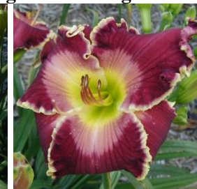
Kingdom Without End