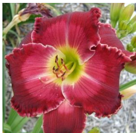
Blood Sweat and Tears