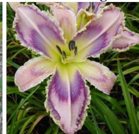
Entwined in the Vine