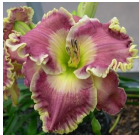
Heartbeat of Heaven