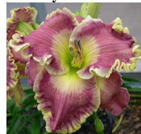
Heartbeat of Heaven