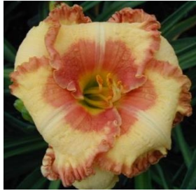
Little Light of Mine