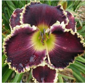
Skin of My Teeth