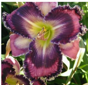
Alpha and Omega