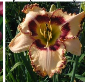
King of the Ages