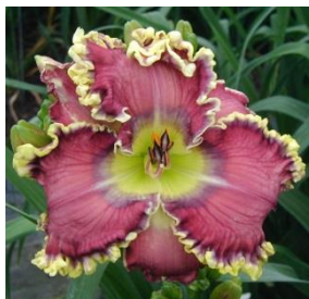
All Things to All Men