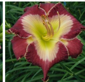
Forty Days and Forty Nights