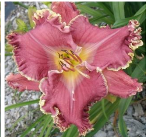
Wrestling with Angels