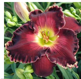
Born to Reign