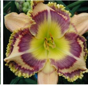
Moses in the Bulrushes