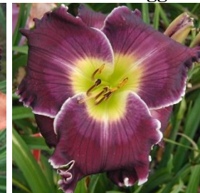
Faith that Moves Mountains