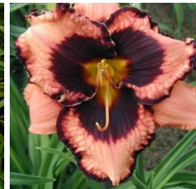
Eyes on the Prize