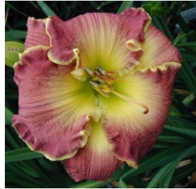
Rock of Salvation