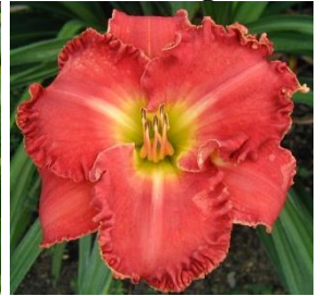
Soul on Fire