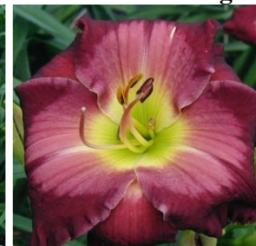
Isle of Patmos