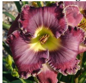
Desire of Nations