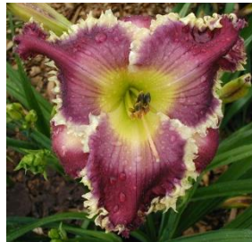
Thistles and Thorns