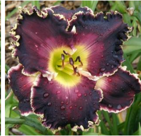
Soli Deo Gloria