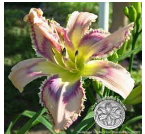
Entwined in the Vine