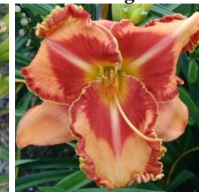
Lake of Fire